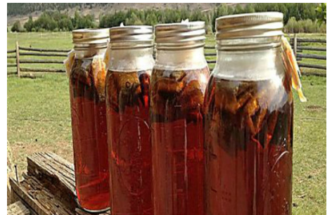
Do This Tonight To Lose 2 Lbs Of Belly Fat By Morning