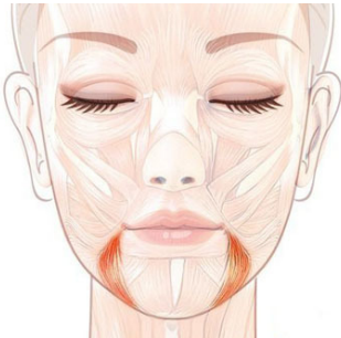
Paano magmukhang 30 kapag 60 na? Basahin dito