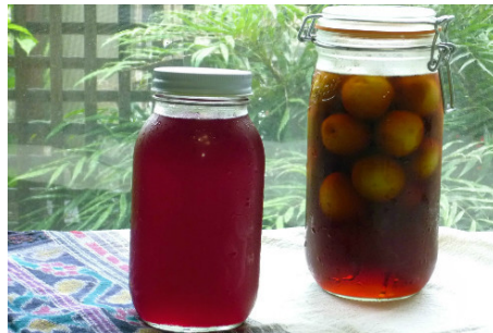
Drink This Tonight And Lose 1kg Of Belly Fat By Morning