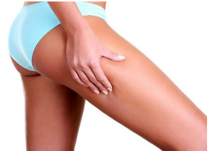
Taba maaaring alisin sa loob ng ilang araw - subukan ito!